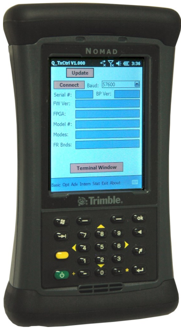
Ruggedized Handheld Programmer

The easiest way to remotely control all transmitter functions without a bulky computer or monitor