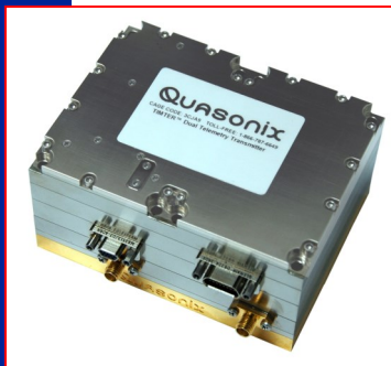
SIDE BY SIDE DUAL TIMTER™